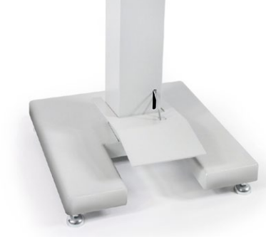
Model 102-20 / 102-28