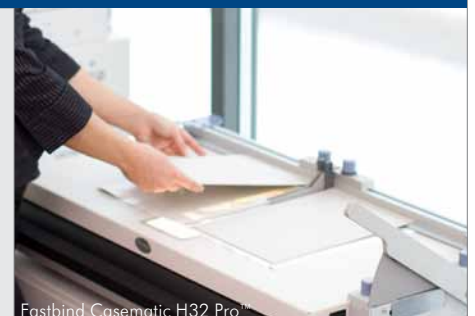
Fastbind Casematic H32 Pro

The BooXTer Duo features a special built-in casing unit to easily attach the hard cover to the pre-bound contents. You insert the cover in the groove to maintain it and just peel-off the end-sheets with your free hands.