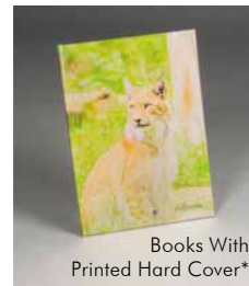
Books With Printed Hard Cover*