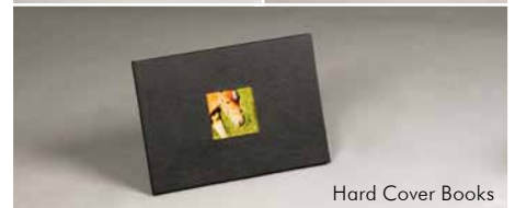
Hard Cover Books