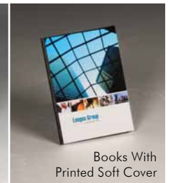
Books With Printed Soft Cover